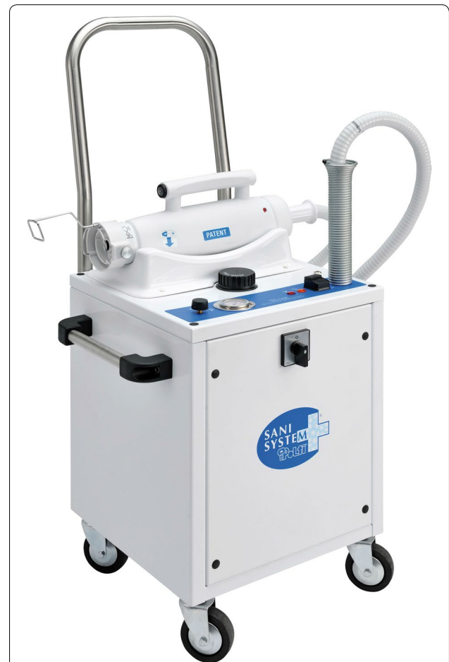
Fig. 1 Overheated dry-saturated steam vapour disinfection device used in this study. (Sani System Polti, Medical Division Polti s.p.a., Como, Italy)

The steam generator device consists of a professional steam generator (Sani System Polti, Medical Division Polti s.p.a., Como, Italy) (Fig. 1). The dimensions of the