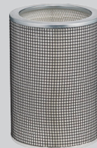
HEPA FILTER 4 YEARS