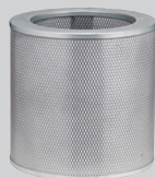
CARBON FILTER 2 YEARS